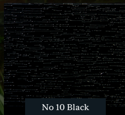
No 10 Black

The print process may not give a 100% accurate colour representation of the actual finish. Furthermore, the finishes have different textured grains. For this reason it is recommended to visit a Residence 9 showroom to see actual swatches of the finishes available.